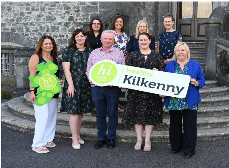
Healthy Ireland Committee at the Launch of the Healthy Ireland Fund 2023- 2025 (June, 2023)