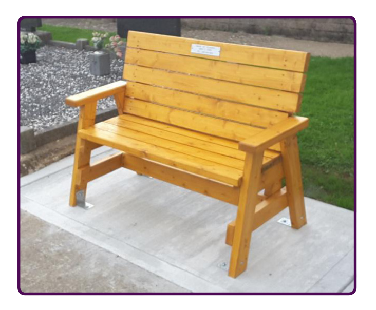
Mooncoin Graveyard Age Friendly Seating.