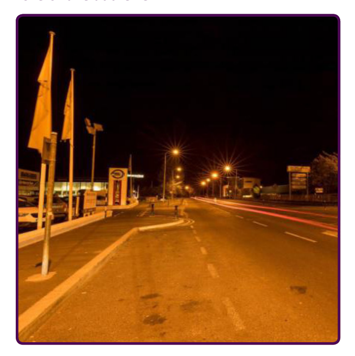
Dublin Rd Kilkenny (Before)