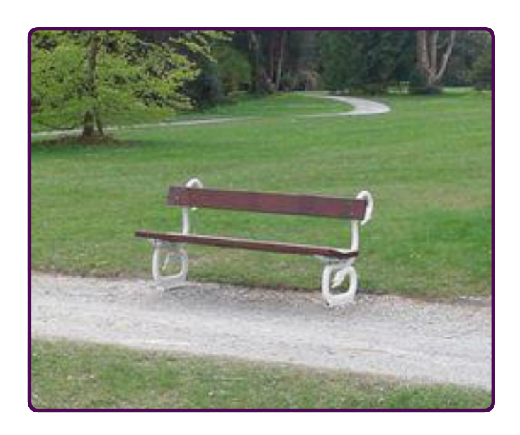
Age Friendly Seating in Woodstock Gardens (Victorian Style)

• New seating has been installed in Woodstock Gardens – it's Victorian in style and in keeping with the gardens' character. Older people were asking for more seats for these expansive gardens.