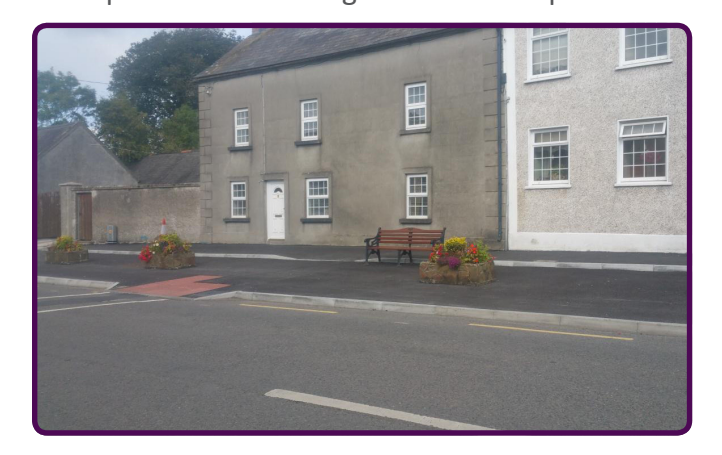
Age Friendly footpath & pedestrian crossing at Ballyhale.