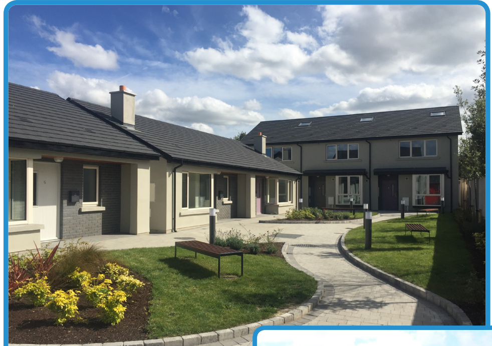
Gaol Rd Housing (After)