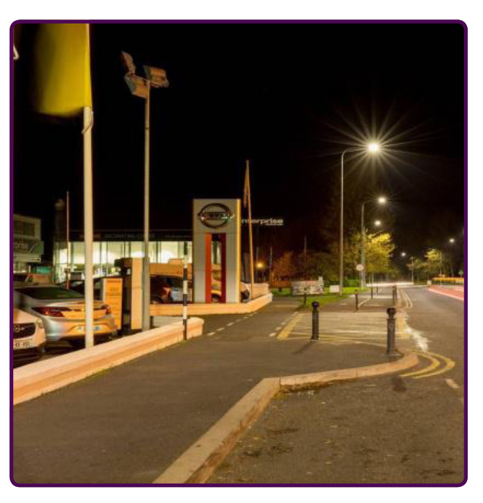
Dublin Rd Kilkenny (After)