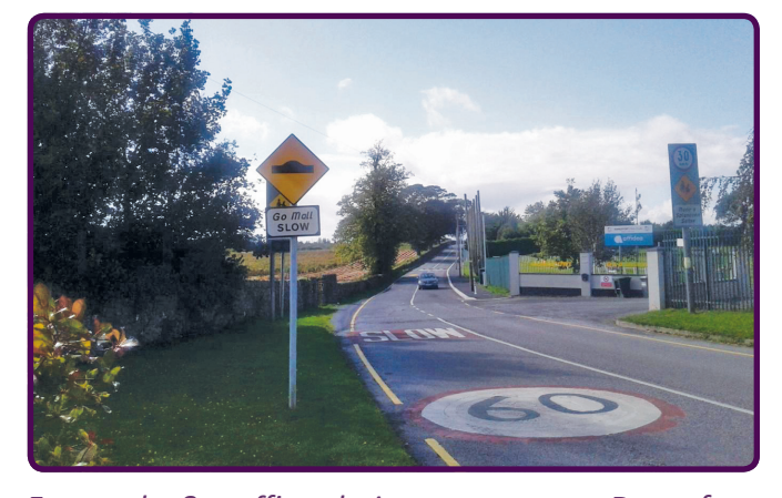
Footpaths & traffic calming measures at Danesfort.