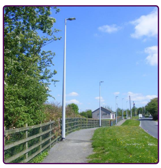
New Public Lighting poles installed on Lovers Lane and New Pedestrian Crossing and Footpath installed on Lovers Lane at the Fen.