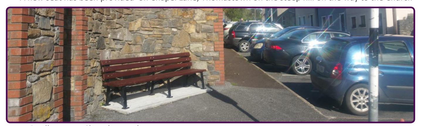
Age Friendly seat at Chapel Lane Thomastown

• A new seat has been provided on Chapel Lane, Thomastown on the steep hill on the way to the Church