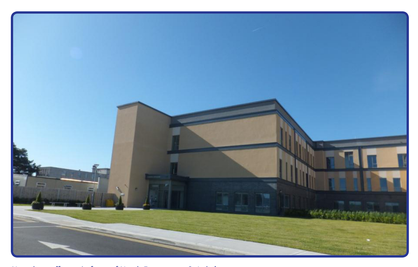
New drop-off area in front of North Entrance at St Luke's