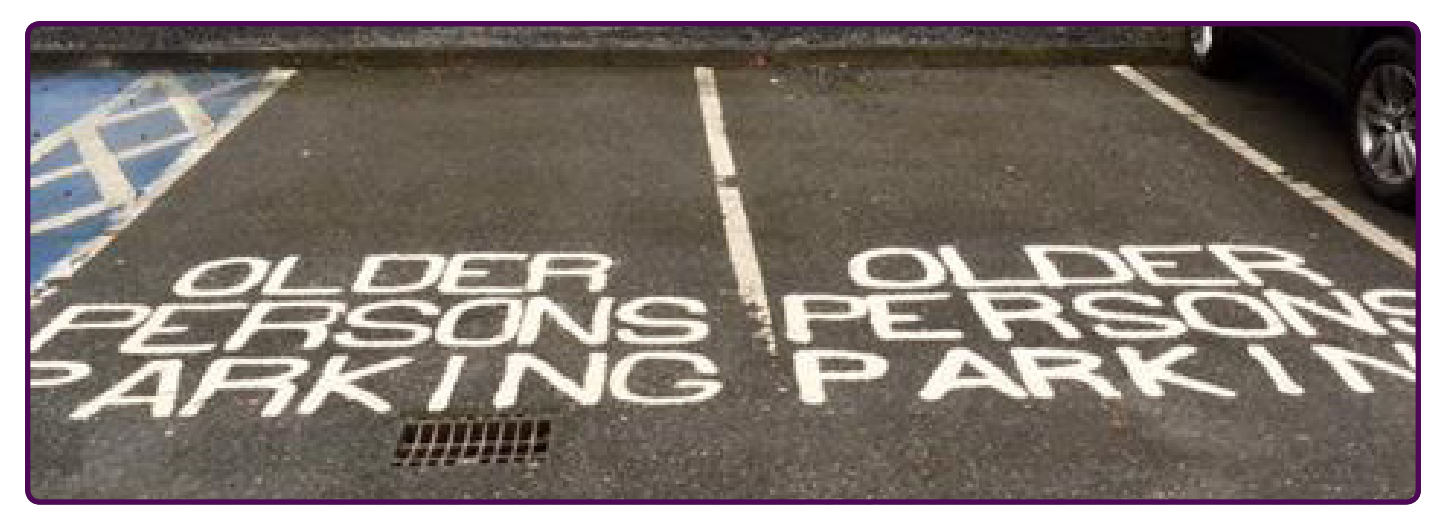
Age Friendly Car Parking spaces at County Hall.