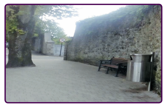
Age Friendly seats at the Castle road Kilkenny City, one at the doctor's surgery, one beside the tourist kiosk and near the Castle gate at the bus stop.

• A new seat has been provided on Chapel Lane, Thomastown on the steep hill on the way to the Church