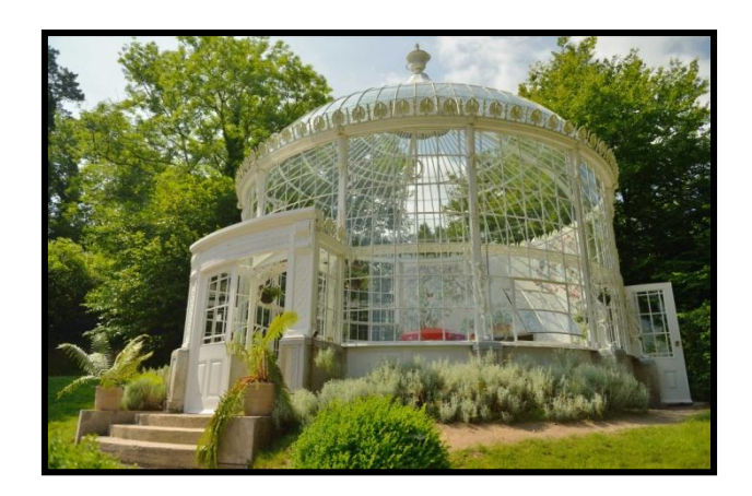
The Turner Conservatory in Woodstock which houses the tea room and is the venue of choice for many couples on their wedding day