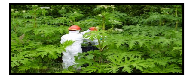
Taking on Giant Hogweed in Kilmacow

The Parks Department is concerned with stopping the spread of invasive species on public lands across the county. A programme of Giant Hogweed eradication is continuing in Kilmacow whilst in Kilkenny efforts to eradicate invasive species, particularly Himalayan Balsam are continuing along the River Nore, predominantly along the Lacken Walk and Canal Walk in conjunction with Keep Kilkenny Beautiful.