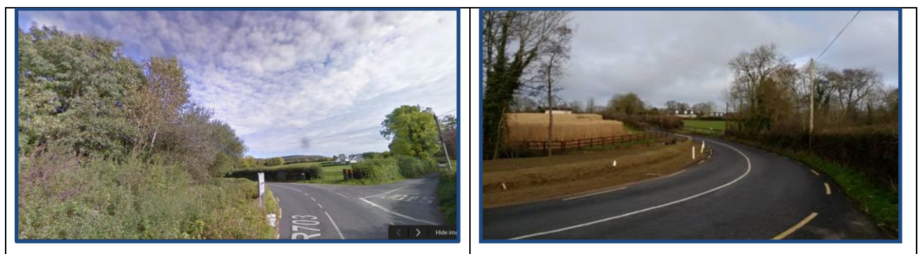
R703 Mong Junction – Before

The Non- National Low Cost Safety Programme is targeted at locations along the nonnational road network which have been identified as collision prone zones. The works carried out under this programme include improved junction delineation and visibility splays, traffic calming, enhanced roadside delineation and pedestrian crossing facilitates within urban areas. In 2016 six schemes were completed under this programme at a cost of €225,000.