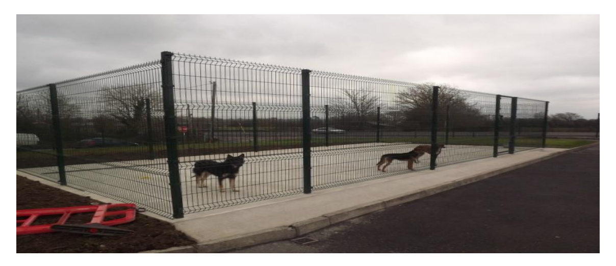
New Agility Area at Dog Shelter Paulstown

Upgrading works to the Dog Shelter at Paulstown commenced in 2016. Works will include additional kennels, new agility area and enhanced isolation unit facilities.