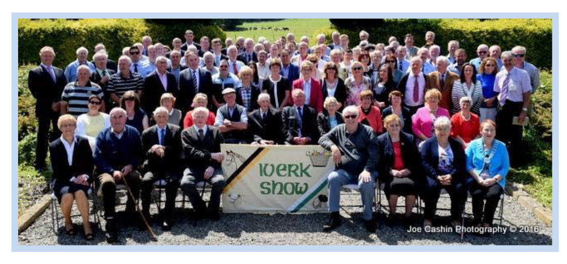
Launch of Iverk Show, Kildalton College, June 2016

anniversary of the show in 2016 (the oldest Agricultural Show in Ireland), and commissioned an oral historian to document and archive oral history associated with the shows history and development.