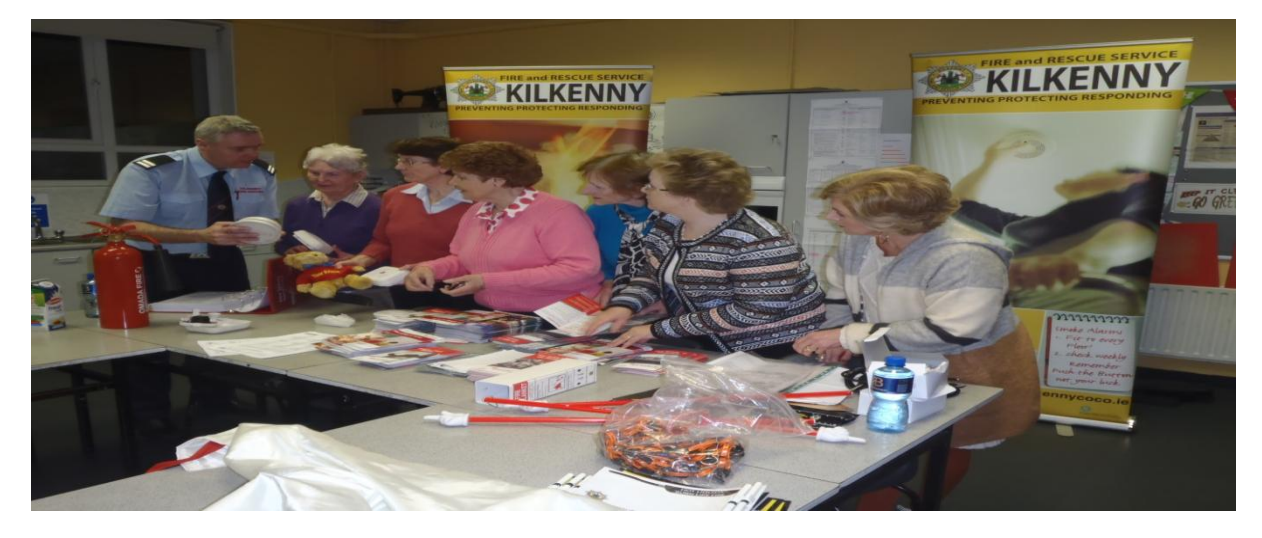
Fire Safety advice for Graiguenamanagh ICA