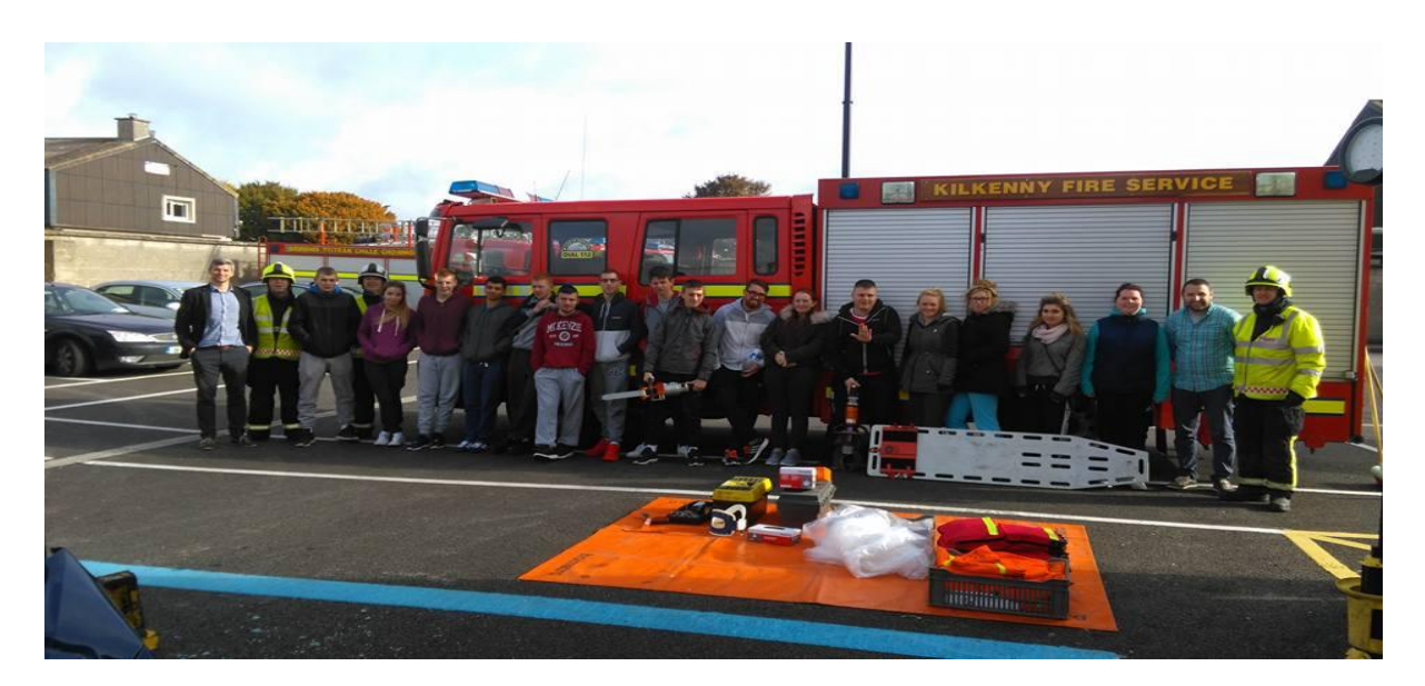
Visit of Kilkenny Youth Reach to Kilkenny City Fire Station