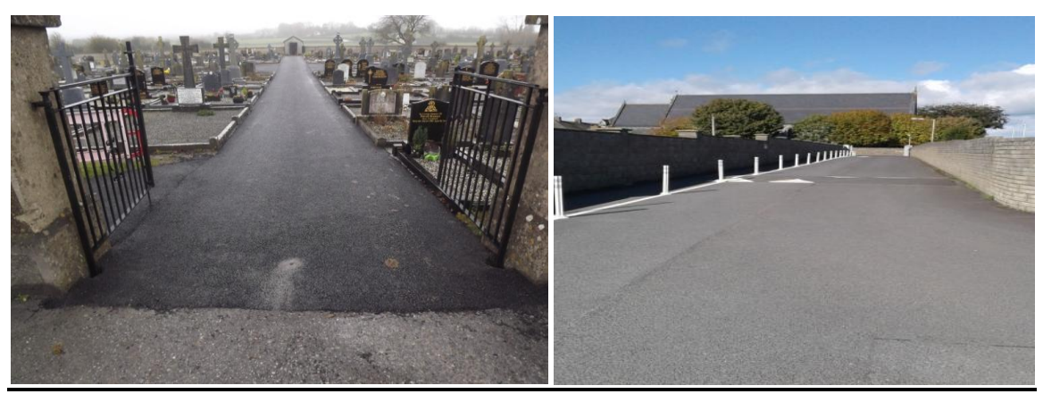
New access road at Freshford Cemetry.