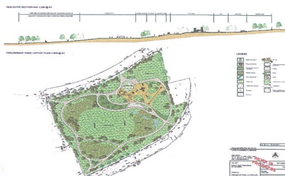
Copy of plan for Ferrybank Park

The objective remains to conduct the procurement process, obtain Departmental approval, and appoint a contractor for the Park construction prior to Christmas. This Park will be funded by a combination of Department of Housing, Planning, and Local Government LIHAF funding, and Kilkenny and Waterford County Councils.