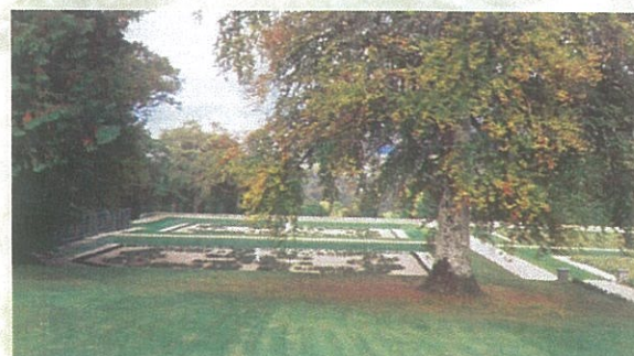
Recent planting at the Winter Garden is establishing well

The Parks Department have completed their annual repairs to the playgrounds around the county with the intention of maintaining the playgrounds in good condition and to be fit for use. As the playgrounds age, and the wear and tear becomes more significant, entire pieces of equipment may require replacement. This is