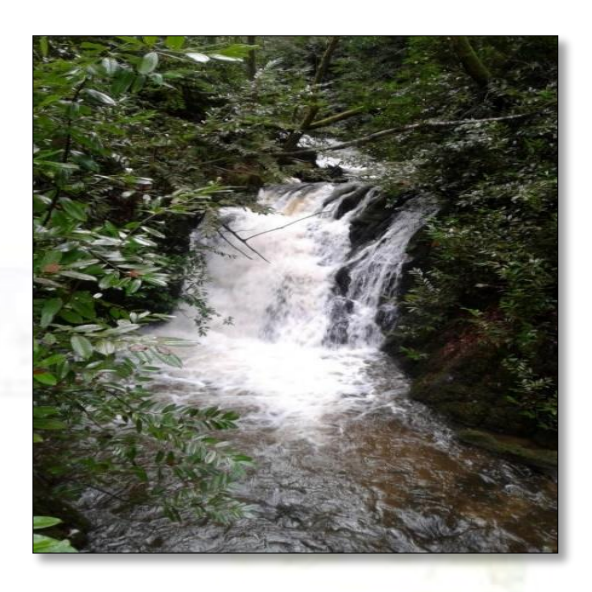
Waterfall at the Brownsford Stream, Woodstock Estate

Woodstock Estate has once again been successful in securing €200,000 in funding through the ORIS scheme (Outdoor Recreation Infrastructure Scheme). This funding will be used to continue the development of the very successful Loop walks to the Waterfall in the south east of the estate with connections back to the gardens via 'The American Road'. The waterfall is currently a unknown feature due to its isolation in the estate and poor connectivity back to the village and the gardens. This funding will assist in opening up access and increasing the length of the loop walks within the estate.