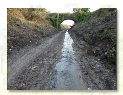
December 2020 - View of old railway track through the Ferrybank urban area

Following a competitive process, consultants have been appointed to bring forward options for links from the Greenway to the villages of Slieverue and Glenmore. They have carried out a preliminary assessment of options and will arrange a public consultation to discuss these options with locals when they have been further investigated. A Business Development Executive will also be employed shortly to help local people, businesses and communities to develop business opportunities along the Greenway.