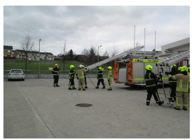
Ladder & Pump Relay Practice

The Brigades have attended a variety of incidents in the first quarter of 2021. These incidents included an apartment fire, a number of road traffic collisions, a tractor on fire, chimney fires, an Ambulance assist with a Covid-19 patient, trees down and also assisted An Garda Siochána at the scenes of a fatality.