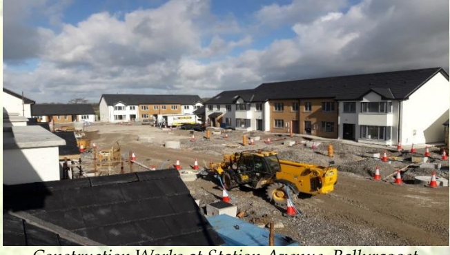
Construction Works at Station Avenue, Ballyragget