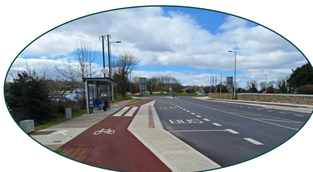
Similar bus bay, Newtown Road, Wexford Town