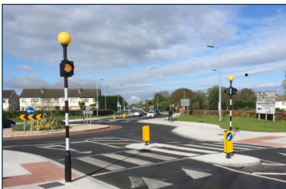
Similar roundabout crossing, Main Road, Tallaght