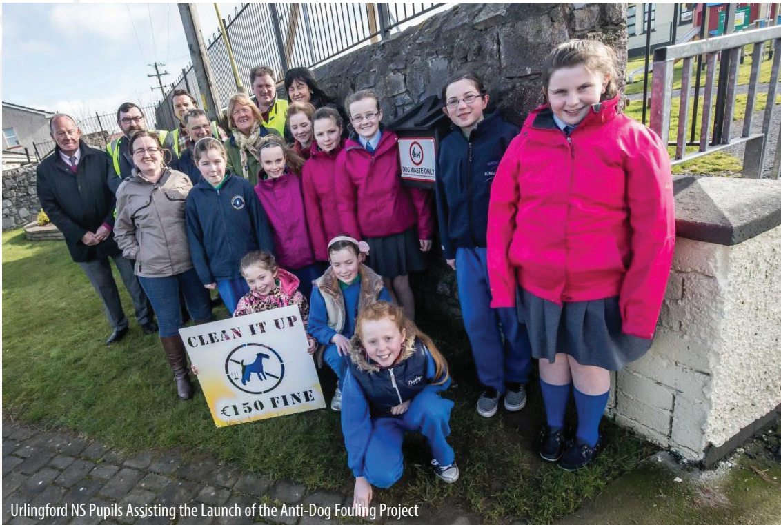
Urlingford NS Pupils Assisting the Launch of the Anti-Dog Fouling Project