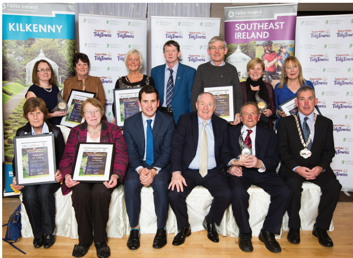
Regional Tidy Towns Awards Presentation (2016)