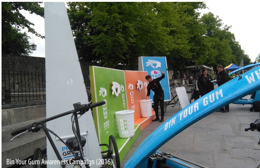
Bin Your Gum Awareness Campaign (2016)