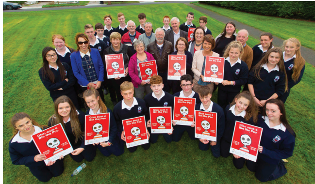
Anti-Dog Fouling Campaign (Ferrybank, 2016)

The Council acknowledges the role the wider community has in litter control and it must promote the anti litter message to ensure all individuals take responsibility not to create litter. A large sector of the community plays a significant role in combating litter by organising litter patrols and in rural areas some community groups take on the responsibilities of emptying litter bins locally.