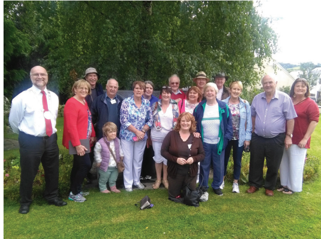
Tidy Town Forum wMembers visiting Clonegal Tidy Towns, Co. Carlow.

The National Tidy Towns Competition is going from strength to strength and local participating groups meet at the Tidy Town's Forum meetings which are facilitated by the Council. The forum facilitator lines up speakers, provides funding announcements and grant guides in a social environment to allow groups to discuss issues that pertain to their local areas and their voluntary work. The forum is running successfully over the past three years and the networking is considered beneficial and worthwhile as local groups can learn from each other.