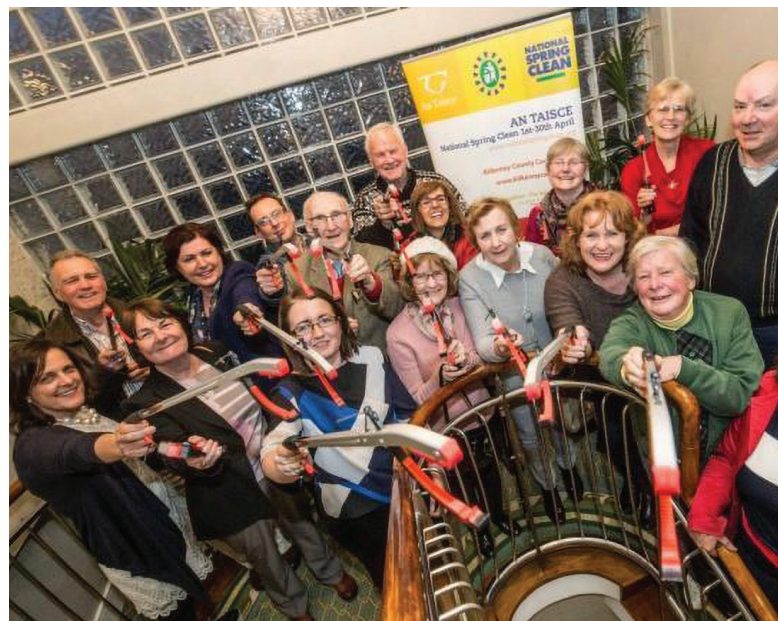
National Spring Clean Launch (2017)