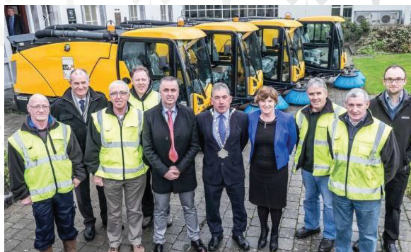
New sweepers for Callan, Castlecomer, Graigueanamanagh & Thomastown arrived in 2016 following a procurement process run in conjunction with the Office of Government Procurement.

An intensive street cleaning schedule exists for Kilkenny City and municipal district areas covering Castlecomer, Callan, Piltown & Thomastown. In 2016, the street cleaning (road sweepers operations) accounted for 80% of total litter control expenditure.