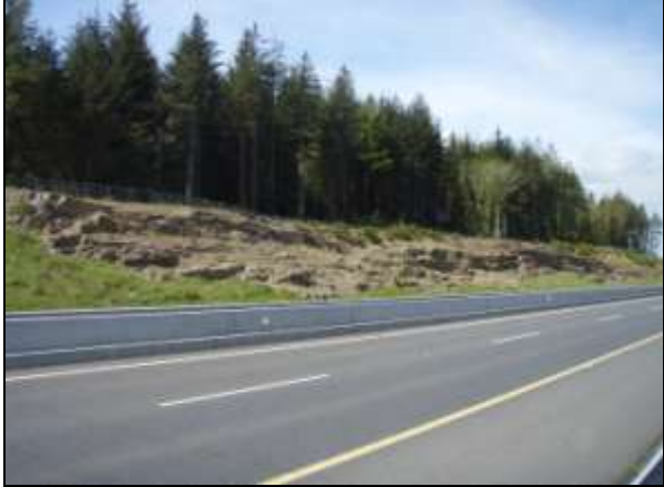
Thicker rock sections on the west side.