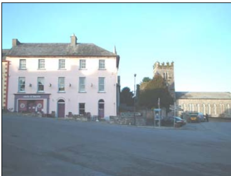
Closure provided by the church looking north

The full potential of the area is not realised as there is a lack of directional stability and insecurity due to the expanse of tarmac and the existing road pattern. There is a lack of definition for the movement of vehicular traffic and for pedestrian movement.