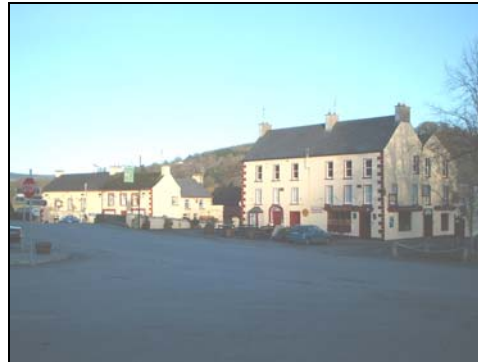
Lack of directional stability from large tarmac area