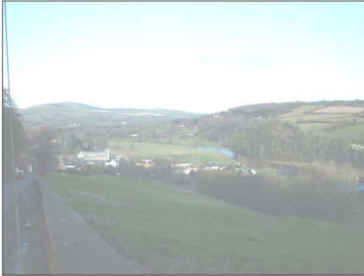
Fig 1: View from outside the gates of Woodstock Gardens

The difference in level between this point and the square in the village over a distance of some 560 metres is of the order of 56 metres.