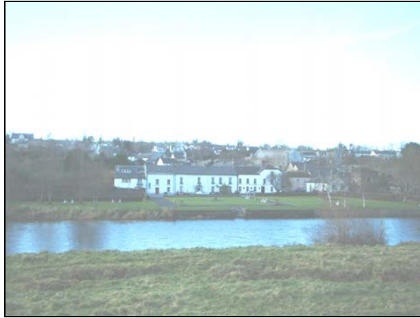
Fig. 2: View of Inistioge from the east bank