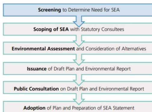
Figure 2.1: Screening in the overall SEA Process (Source: EPC, Good Practice Guidance on Screening, 2021).