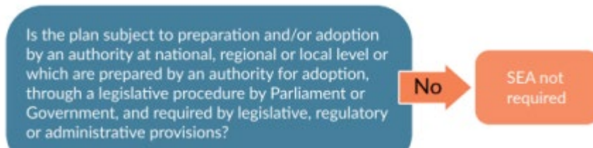
Figure 6.1: Outcome of Stage 1 Applicability Screening, as adapted from the research report Development of Strategic Environmental Assessment (SEA) Methodologies for Plans and Programmes in Ireland. Source (Scott and Marsden, 2001)