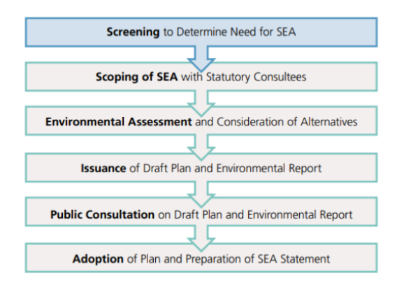
Figure 2.1: Screening in the overall SEA Process (Source: EPC, Good Practice Guidance on Screening, 2021).