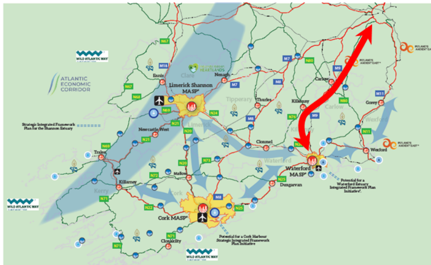
RSES Strategy Map

* Note: Refer to the MASP sections for further details