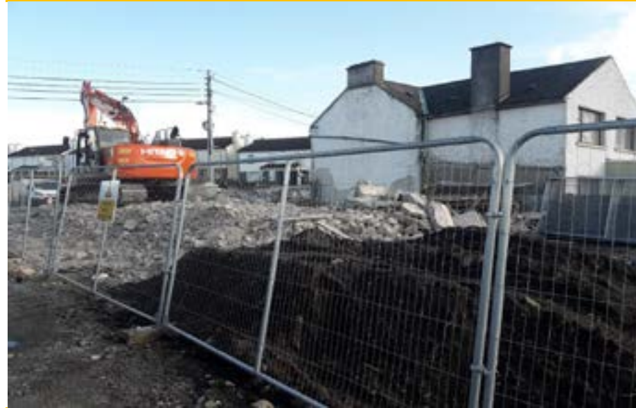
Demolition Works at Golf Links Road Site, Kilkenny City