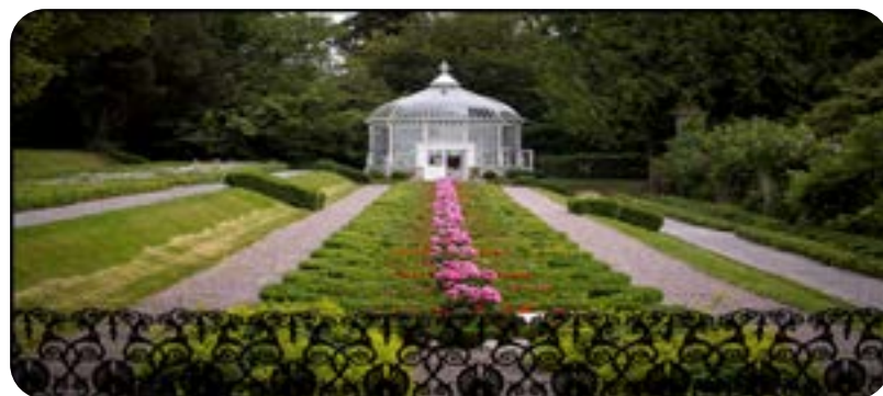
The Flower Terraces at Woodstock in full bloom last summer and the Conservatory House Tea Rooms which will reopen for the 2022 tourism season soon.

Further investigation of the structure and ruins of the former Woodstock House building will have to be undertaken before any action to remove tree growth is undertaken. The 1740's building is being compromised by seedling trees which have taken root in the mortar in the walls and are causing problems to the structure of the building as they grow. The building is also home to bats and owls so timing of any interventions will have to take this into account.