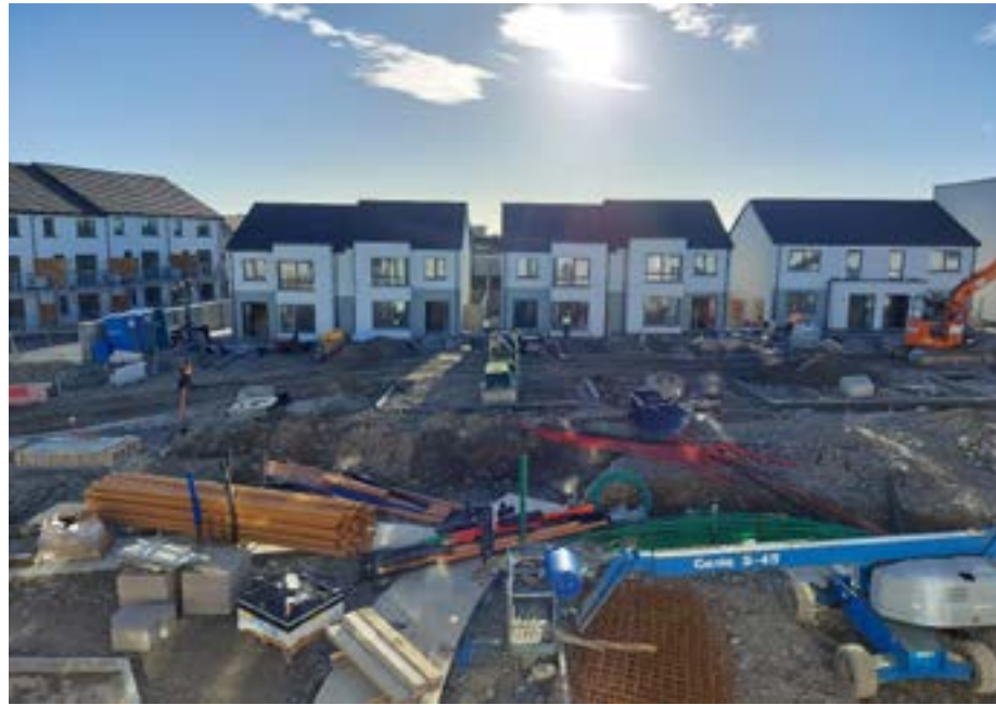
Works at Pennefeather Green, Kilkenny City