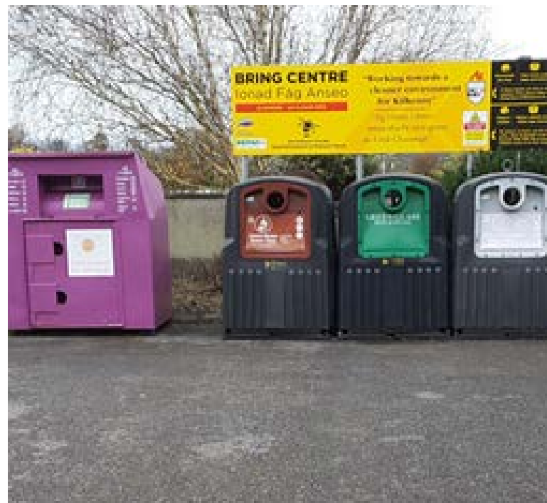
Bring Banks in Glenmore, Co. Kilkenny

The Council provides and manages 46 Bring Centres across the City and County and a total of 373 tonnes of recyclables were collected from our Bring Centres in the first 2 months of 2022. This represents a 16% decrease on the same period last year and is mainly down to society reopening after Covid 19. Loughboy Shopping Centre (with 23.6 tonnes collected YTD), LIDL Loughboy (with 22.74 tonnes collected YTD) and LIDL Thomastown (14.17 tonnes collected YTD) are the busiest outside of the City. Environment Staff are continuing to work very closely with our service providers to ensure the collection service is in keeping with demand, especially around long weekends and holiday periods. Kilkenny County Council is looking to increase the number of recycling centres in the County this year and is currently in discussions with the Tidy Town committee's with regard to suitable locations in towns and villages across the County.