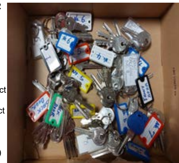
Keys for Pennefeather Court