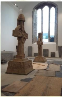
Ahenny High Cross