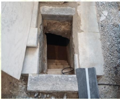
Entrance to Rothe Vault