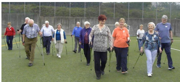
County Go for Life Games 09.05.16

Walking. A great day of fun, laughs and physical activity was had by all. Feedback was very positive.