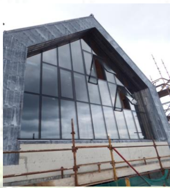
Kilkenny Room Window

and vocal coaches. The week culminates in a number of performances by the choir.