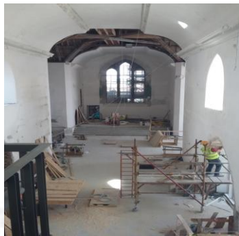
Nave looking East