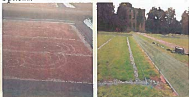
Setting out the topiary panels in the Winter Garden and the sunken panels with drainage and newly shaped terrace slopes

The final phase of restoration of one of the Winter Garden panels is under way with the intricate panels of topiary set out for planting. The clean up after storm damage continues with more recent tree losses during high winds adding to the previous damage from Storm Ophelia.