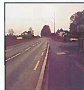
New footpaths at Tinny Park