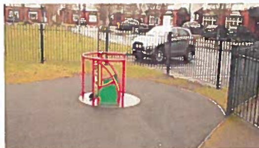
Special needs roundabout at Talbots Court

Proposed new playgrounds: - Johnstown Playground committee received funding for a new playground on a site on the Rathdowney road. The group will apply for funding under the Community and Capital Cultural Facilities Scheme. The Parks Department will support the