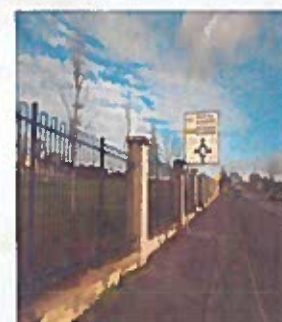
View of the site of the proposed Ferrybank Neighbourhood Park