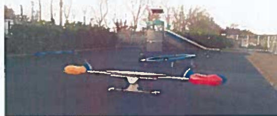
Newly surfaced playground at Fr. McGrath Centre

The Parks Department continue to maintain and upgrade playgrounds around the County. Recent large scale works in January include resurfacing of the entire playground surface in the Fr. McGrath centre and installation of a special needs roundabout in Talbot's Court playground. Funding for these repairs/additions totalling €24,000 was from the Playground maintenance budget. A contractor has been appointed to repair a large piece of play equipment in the Council owned playground at the Castlecomer Discover Park which is structurally unsound due to wear and tear.