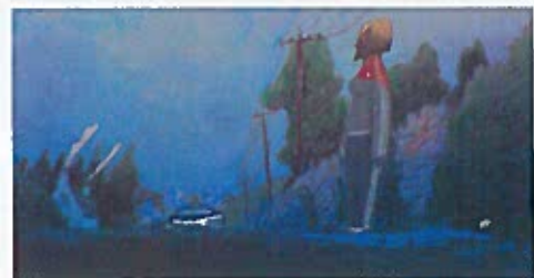
Illustration for ‘an Irish Parish’ by Aoibhinn Young

We continue to illustrate and publish monthly poems by teenagers on our online poetry journal www.rhymerag.net