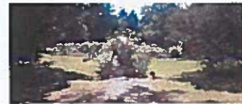
The Rose Garden in full bloom in June sunshine. This old rose is called 'Rambling Rector' and covers the rose arch with an abundance of white scented blooms.

and trees, removal of fallen trees and repair of grounds is now almost complete with planting of new beds and improvements to signage also underway. The current dry spell is causing difficulty with watering new plants, in particular in the newly planted Winter Garden. Visitor numbers are up and tour groups are visiting regularly along with a number of weddings and wedding photographs booked to take place in the gardens. Works on a new natural play area are almost complete. This will provide a large sand pit with willow tunnels and earth mounds for children to engage in free play in a natural environment.