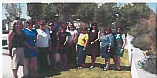
Local Authority Heritage Officers & Biodiversity Officers, with the National Biodiversity Data Centre, met in Co. Hall Portlaoise to review Tidy Towns Pollinator applications

The results will be announced at the National Tidy Towns awards ceremony in Dublin in September.