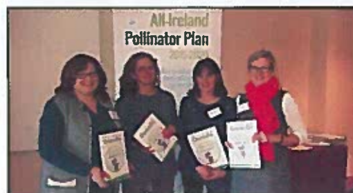
Local Authority Heritage Officers from Kildare, Wicklow, Westmeath & Kilkenny County Council at the Pollinator Conference, Athlone, March 6 th .