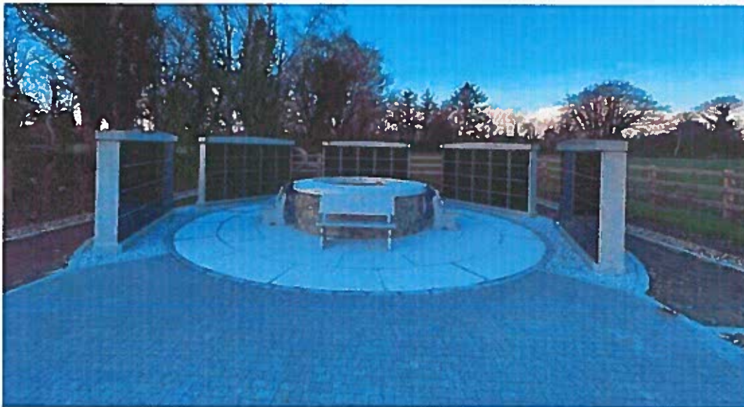
Example: Recently Opened Columbarium Wall Garden Killarney (December 2020)

A Columbarium wall is a structure used for the respectful inurnment of human remains. It houses a collection of niches designed to receive a receptacle containing the cremated remains or ashes of family members. Each niche has an individual front section incorporating a memorial plaque. The cremated remains are placed behind the plaque in a receptacle or urn designed specifically for that purpose. The memorial plaque is engraved with an inscription. Each niche can typically accommodate two cremated remains.