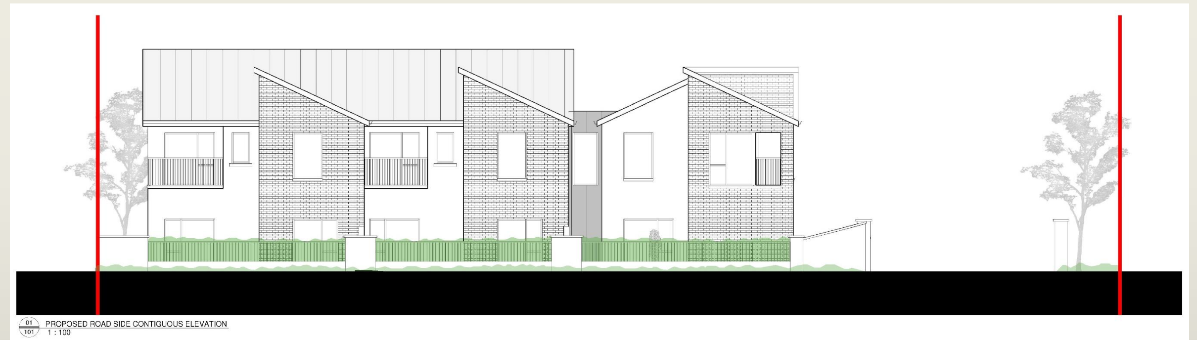
Front Elevation – Facing Dunningstown's Road.