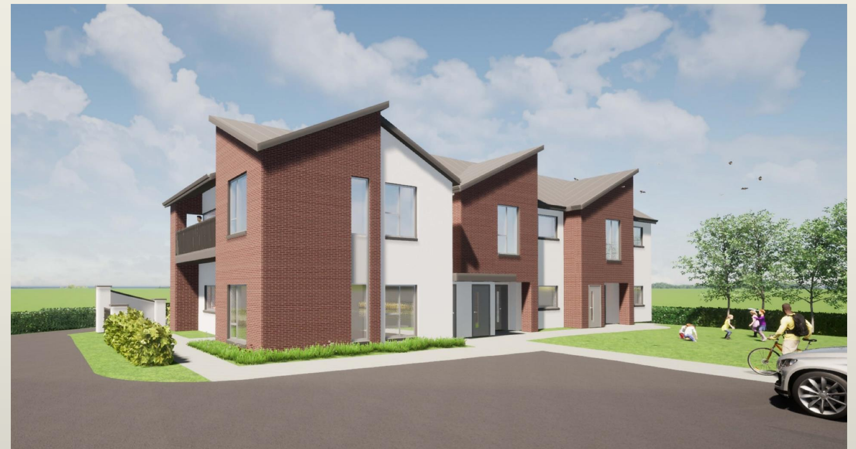
3D view of the proposed internal elevation.