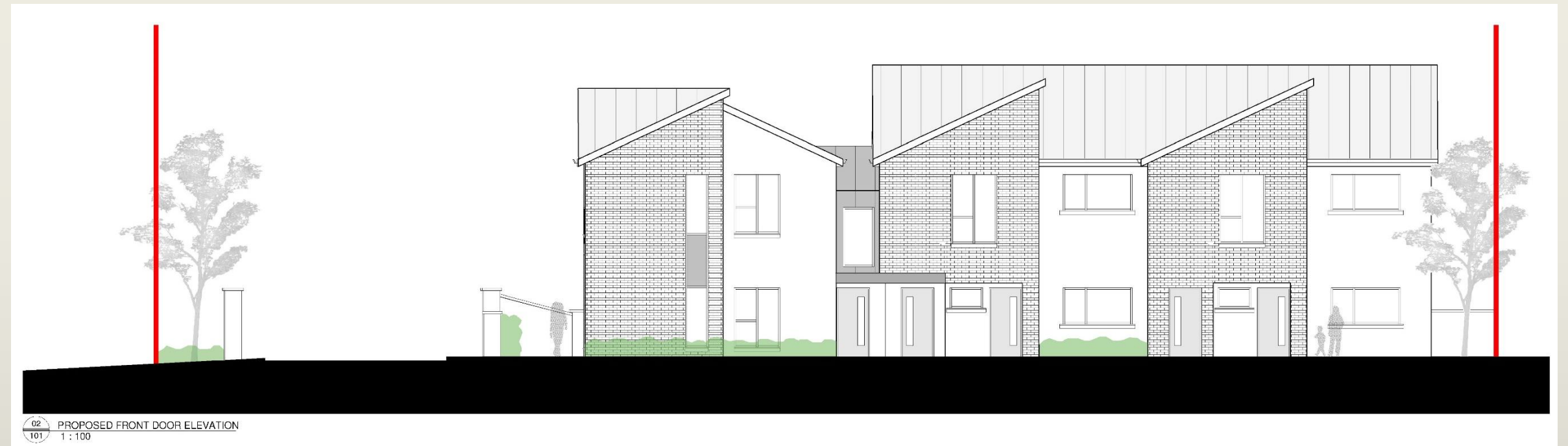
Rear Elevation – Facing P.O.S. and showing apartment entrances.