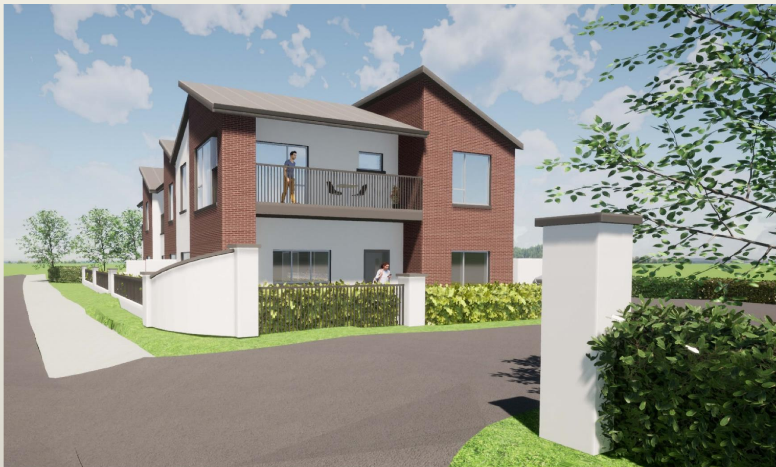
3D view from the proposed site entrance.