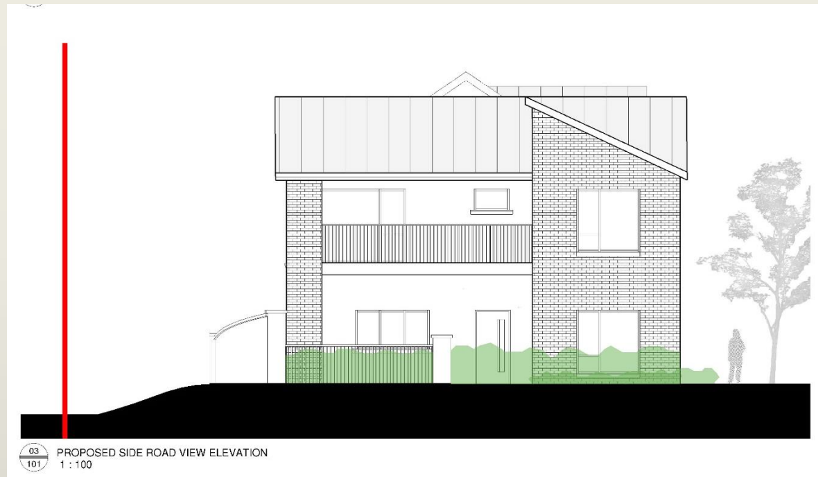
Side Elevation – Facing proposed entrance road.