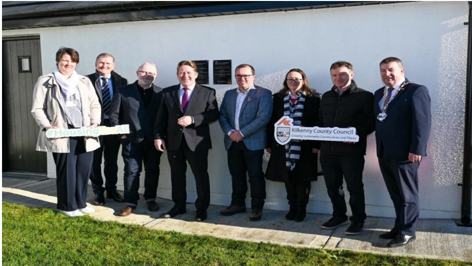
Station Avenue, Ballyragget

In November 2022, Minister Darragh O'Brien was welcomed to Kilkenny to officially open a number of housing developments and to view other projects underway. While Kilkenny County Council have a strong delivery pipeline under the Housing for All Programme the target for delivery in 2022 of 170 units will not be met. Delivery for the year 2022, of substantially complete new build housing units will be 166. In addition to this delivery, 14 acquisitions and 3 units under the Traveller Accommodation Plan will also be delivered giving an overall social housing delivery for the current year of 183.