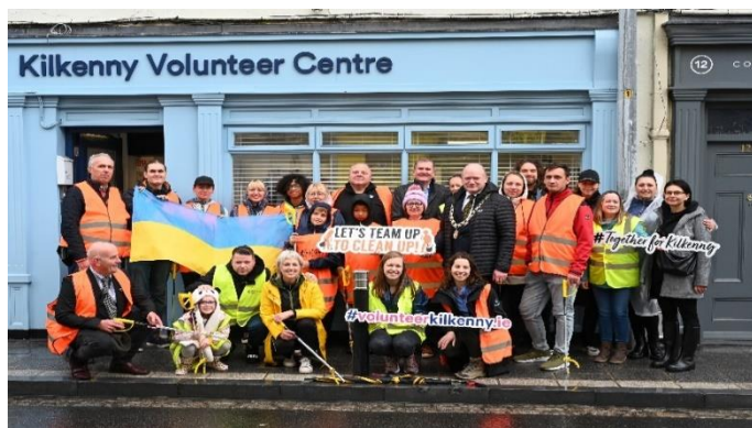
Kilkenny Volunteer Centre

Photos taken of participating groups in 'Lets Team Up to Clean Up' on 9 th October 2022.