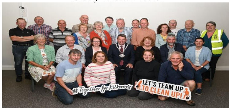
Tidy Towns Forum in Ballyragget