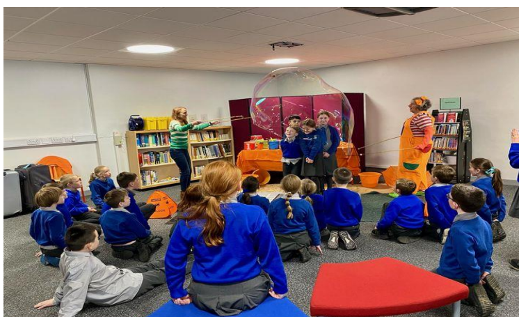
City Science week Loreto TY

We had an action-packed Science week in Kilkenny this year again, working with Calmast as part of Kilkenny Science Festival. With 9 school class events, across the county and a Climate change themed escape room day in City Library. 311 children enjoyed our workshops and 150 daffodil bulb packs were handed out to as part of our age friendly Science week event.