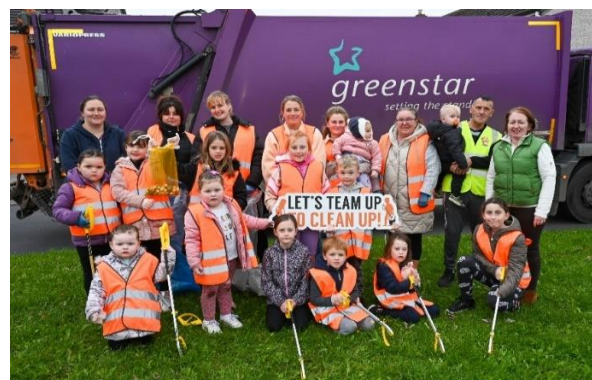
Loughlin Court, Kilkenny