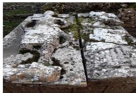
The MacGiolla Phadraig Tomb, Grangerfertagh will be addressd in the Conservation Plan

The draft conservation report for Grangefertagh Church & Graveyard is almost complete. Final report is due to be submitted by the end of the year. It is anticipated that an application for Stream 1 Capital Works will be made in 2023 for this location through the Community Monuments Fund.