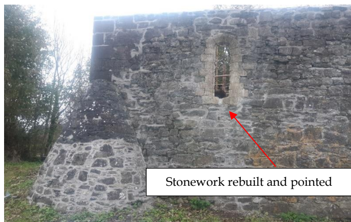
Dunkitt Church and Graveyard