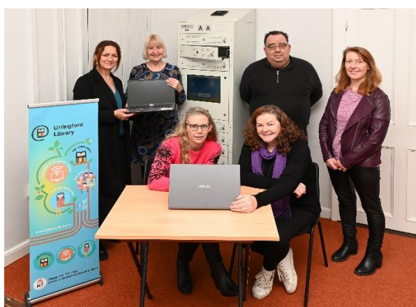
Urlingford Library Laptops

We are delighted to have launched our laptop borrowing service in Urlingford Library in November, in partnership with Urlingford Town Team and Urlingford on the Move.