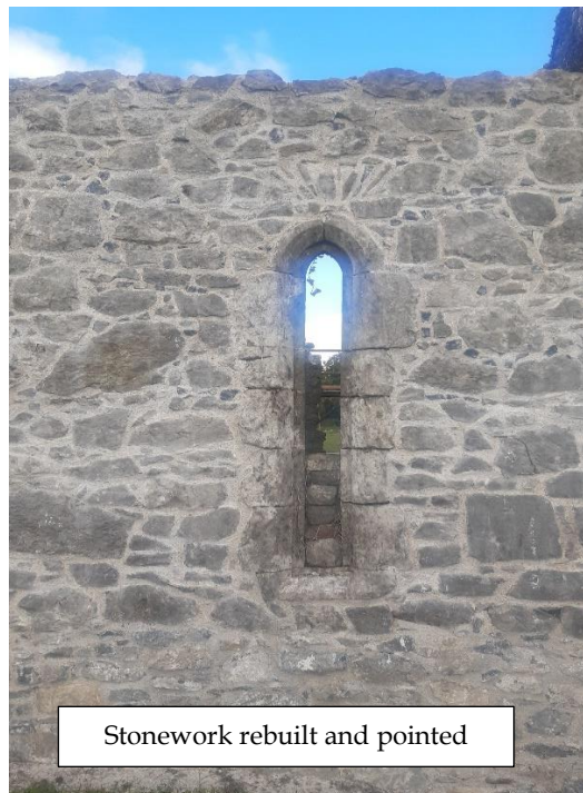
Clomantagh Church and Graveyard