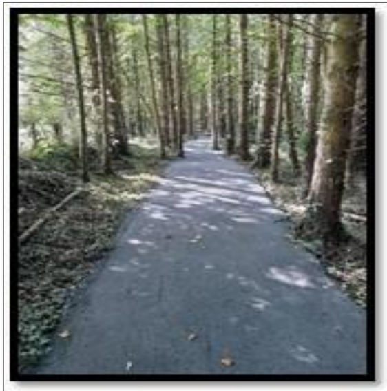
Before and After Images of the Ardra Loop Walk