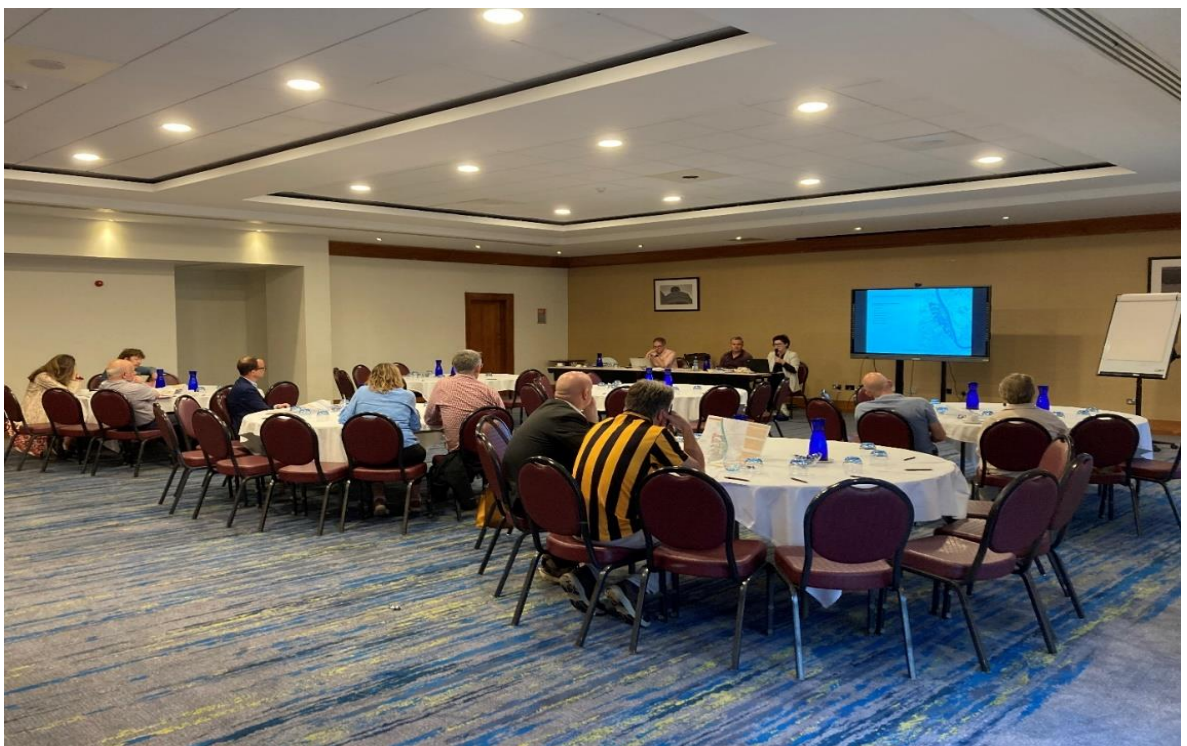
Members of the public attending the second in person event