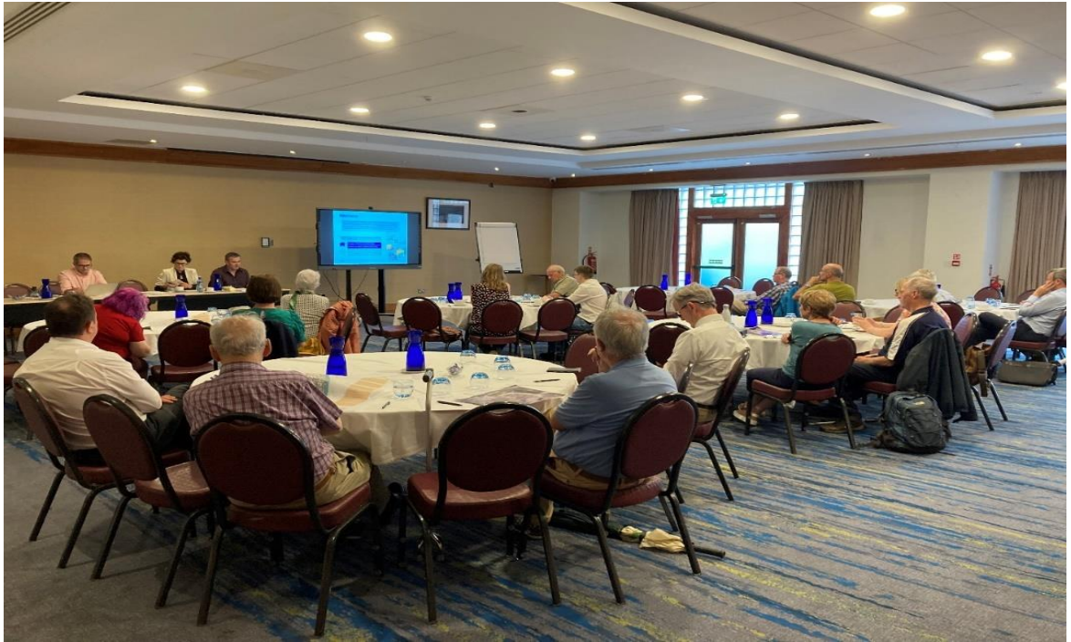
Members of the public attending the first in person event