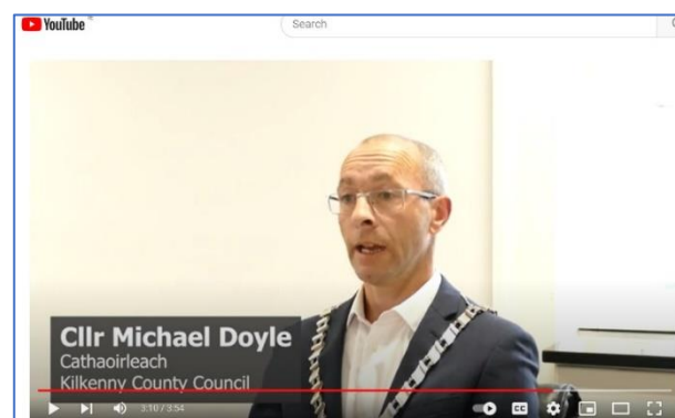
Climate Action video produced by Kilkenny County Council

The Climate Action Office produced a short video outlining the work that Kilkenny County Council is doing to address climate action, as context for the Draft Climate Action Plan. The video was hosted on the Kilkenny County Council YouTube channel and received 289 views from 10 th October, 2023 to 18 th January, 2024. It was also promoted on the Kilkenny County Council Facebook page. An advert ran from 24 th November to 20 th December, 2023. It had a reach of 20,263; 47,109 impressions; and 154 link clicks.