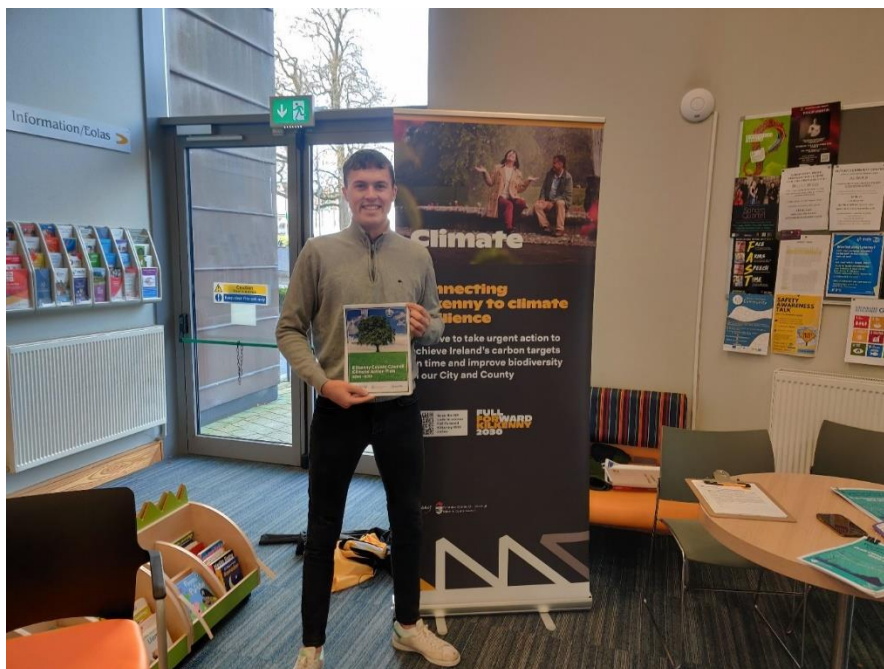
Kilkenny County Council Climate Action Team at public drop in clinic at Ferrybank Library 21 st November 2023