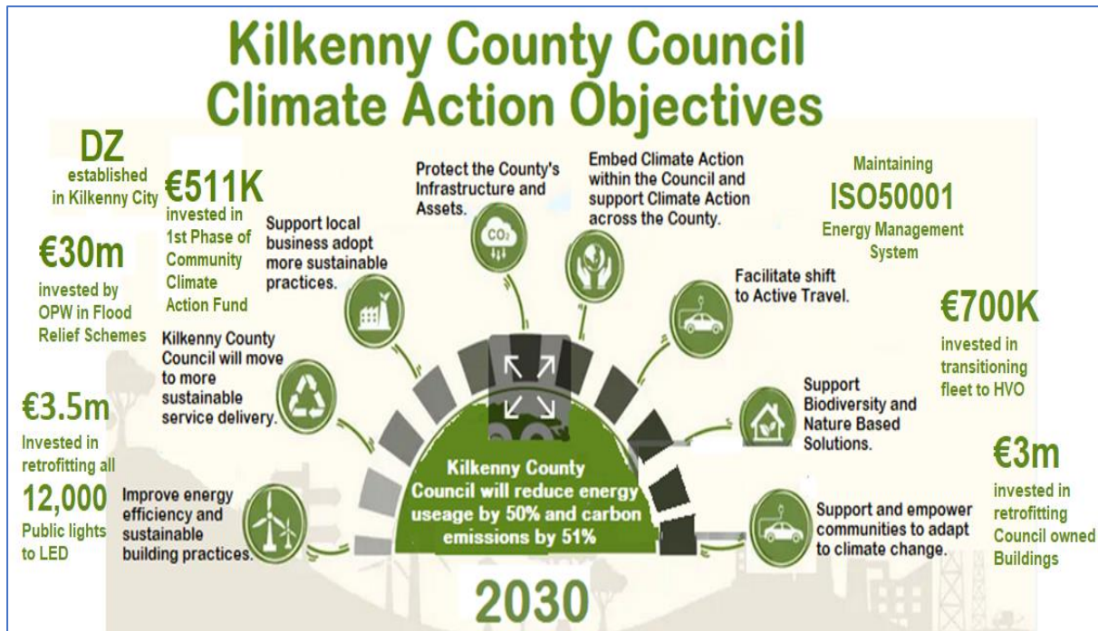
Kilkenny County Council Climate Action Objectives