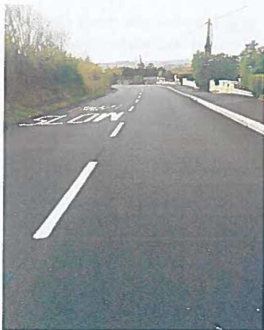
Photo of the Yellow Road, newly resurfaced with footpath reconstructed under the 2016 RWS